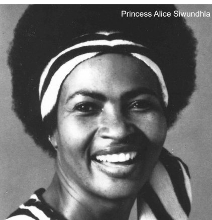
Princess Alice Siwundhla